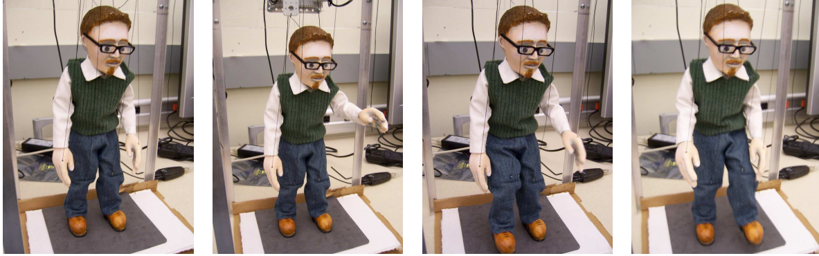
(a) Puppet in initial configuration. (b) Puppet in wave motion. (c) Puppet starting a walk. (d) The final step in the walk mode.